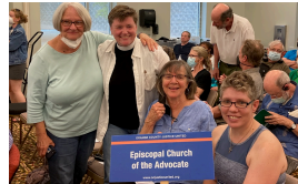
JUSTICE UNITED SPRING MEETING