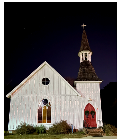
Church of the Advocate, Christmas 2022